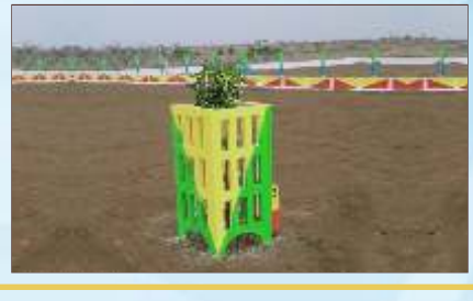
TREE WITH TREE GUARD