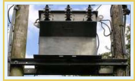
SEPARATE ELECTRIC TRANSFORMER