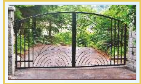
OPEN SPACE GATE