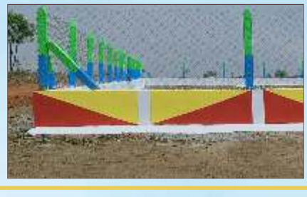
OPEN SPACE WALL & NET COMPOUND